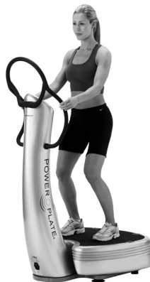
Legs slightly bent.