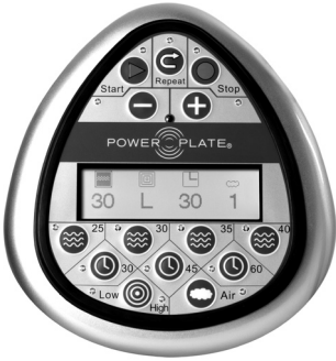
Power Plate® pro6™ face plate

The Power Plate machine is very easy to operate, as you can tell from a brief review of the primary buttons on the face plate.