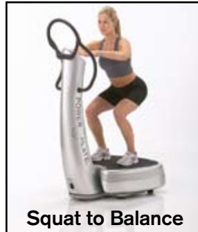
Squat to Balance

Exercise: 3 Sets/Duration 2 x 30 seconds Frequency/Amplitude 30 Hz/Low Rest 60 sec between sets Execution Dynamic