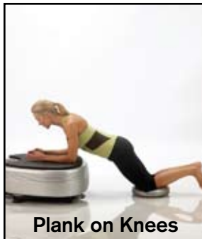
Plank on Knees

Sets/Duration 3 x 45 seconds Frequency/Amplitude 30-40 Hz/Low Rest 45 sec between sets Execution Static or Static Variable