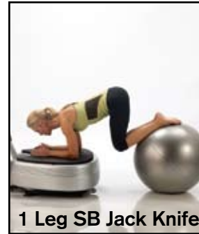
1 Leg SB Jack Knife