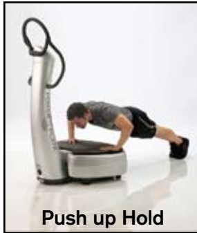
Push up Hold

Exercise: 5 Sets/Duration 3 x 45 seconds Frequency/Amplitude 30-40 Hz/Low Rest 45 sec between sets Execution Static or Dynamic