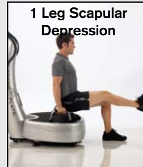
1 Leg Scapular Depression