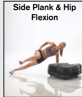
Side Plank & Hip Flexion