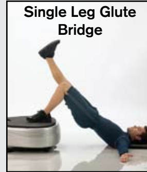
Single Leg Glute Bridge