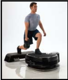
Exercise: 1 - Lunge

Sets/Duration 2 x 45 seconds Frequency/Amplitude 30-40 Hz/Low Execution Static, Static Variable or Dynamic