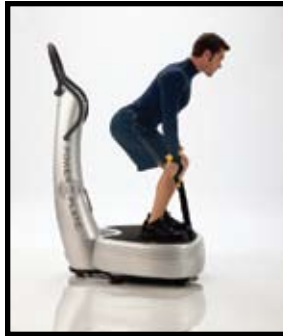
Exercise: 5 - Dead Lift

Sets/Duration 2 x 45 seconds Frequency/Amplitude 30-40 Hz/Low Execution Static, Static Variable or Dynamic