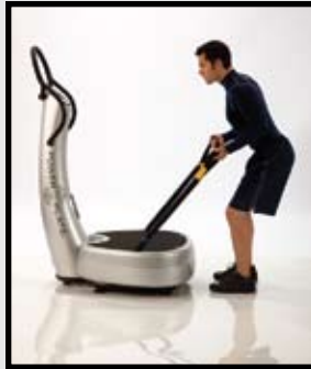
Exercise: 2 - Bent Over Row

Sets/Duration 2 x 45 seconds Frequency/Amplitude 30-40 Hz/Low Execution Static, Static Variable or Dynamic