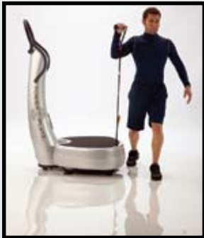
Exercise: 7 - Shoulder Press

Sets/Duration 2 x 45 seconds Frequency/Amplitude 30-40 Hz/Low Execution Static, Static Variable or Dynamic