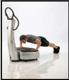
Exercise: 4 - Push up

Sets/Duration 2 x 45 seconds Frequency/Amplitude 30-40 Hz/Low Execution Static, Static Variable or Dynamic